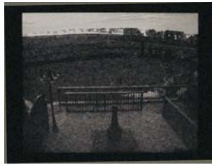
High end colour/mono